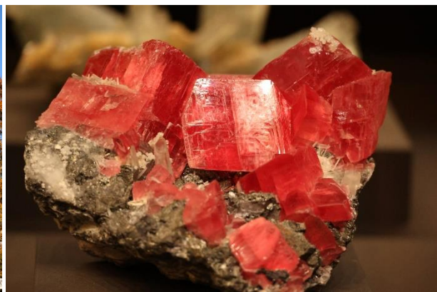
Terra Mineralia, one of the largest mineral collections in the world, Freiberg (Ore Mountains)