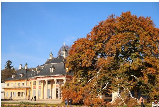
Pillnitz Castle, Dresden

For international visitors who would like to explore Dresden and Saxony beyond the conference, we recommend that you have a look at the websites of Dresden Tourism and Visit Saxony . From the world-famous Semper Opera and the Zwinger Palace in Dresden’s Old Town to the lively neighborhoods of Dresden Neustadt (“new town”), and from the sandstone mountains of Saxon Switzerland to the vineyards along the Elbe River, from historical steam trains to the European Capital of Culture in Chemnitz, there is a lot to explore in and around Dresden.